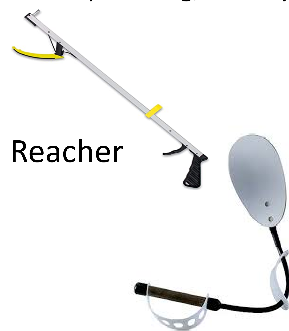
Reacher Long-handled mirror

Adaptive equipment Lower body dressing/toilet hygiene