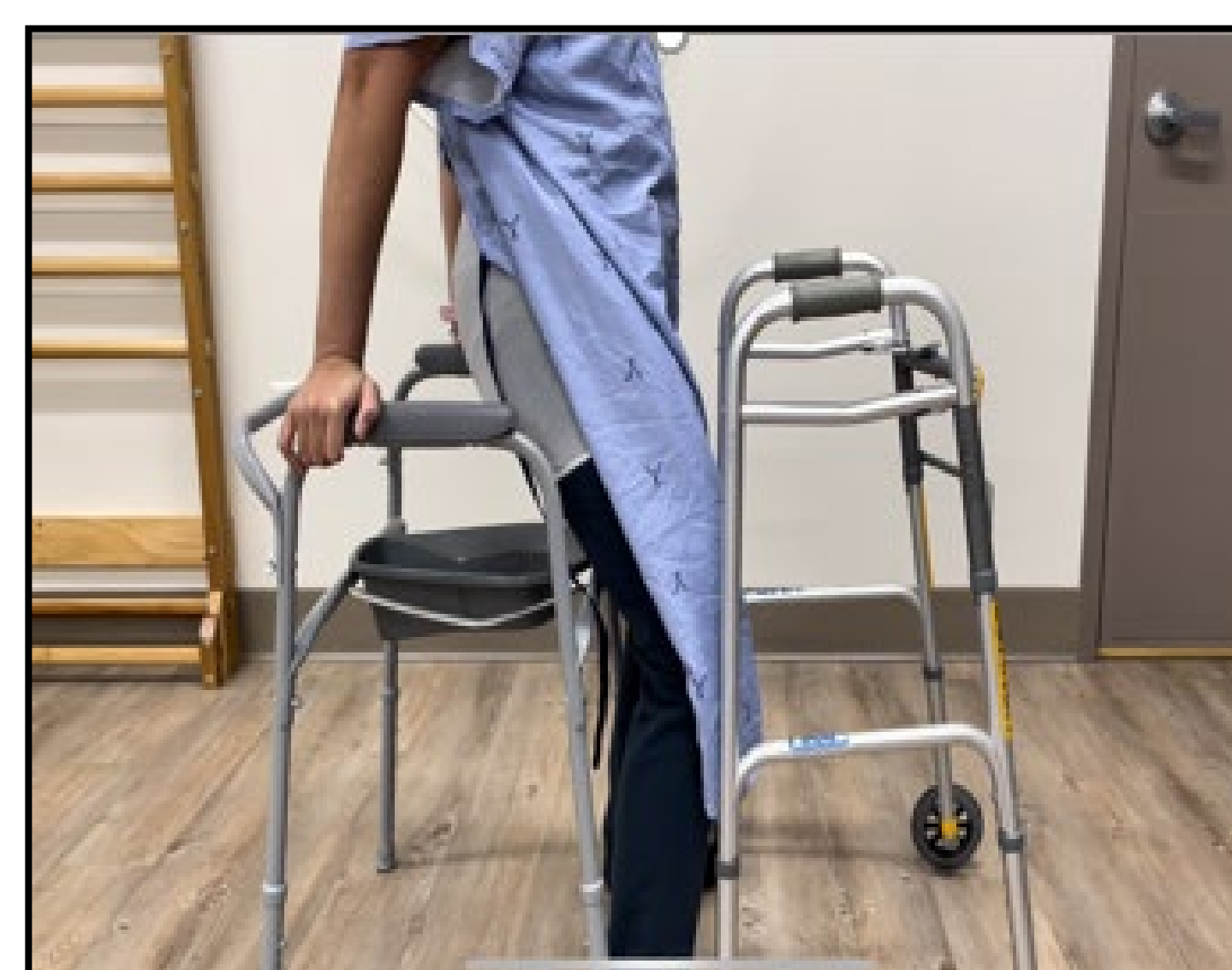
Toileting Using a Bedside commode

Adaptive equipment Lower body dressing/toilet hygiene